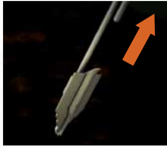
Remove Drive Steel